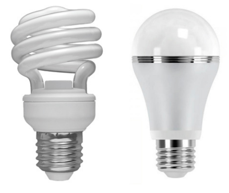
CFL LIGHT BULB

Some utility companies give customers the opportunity to request that most or all of their electricity comes from carbon neutral sources or purchase these credits on their bill. Some schools and homes are equipped with solar photovoltaic systems or wind turbines that generate as much electricity throughout the year as the buildings use. There are many ways to decrease your energy carbon footprint.