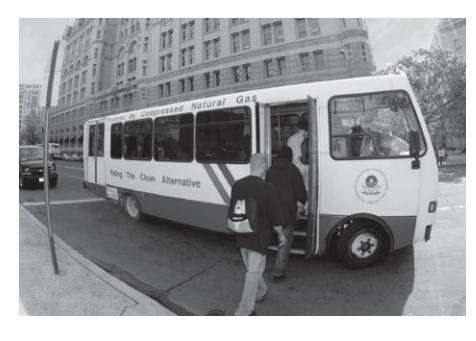
NATURAL GAS BUS

What are the different ways students and teachers use transportation at your school? What are some ways you can reduce your carbon footprint in the ways you use transportation?