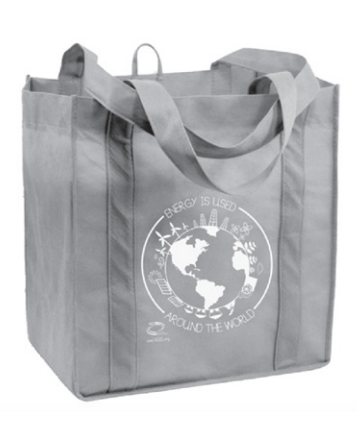
REUSABLE GROCERY BAG