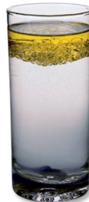
Oil floating on water