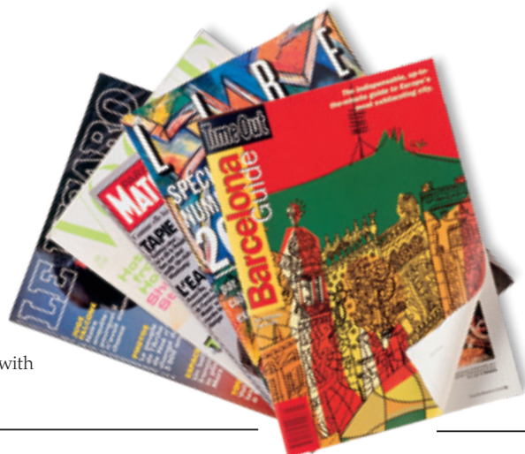
Magazines printed with oil-based inks