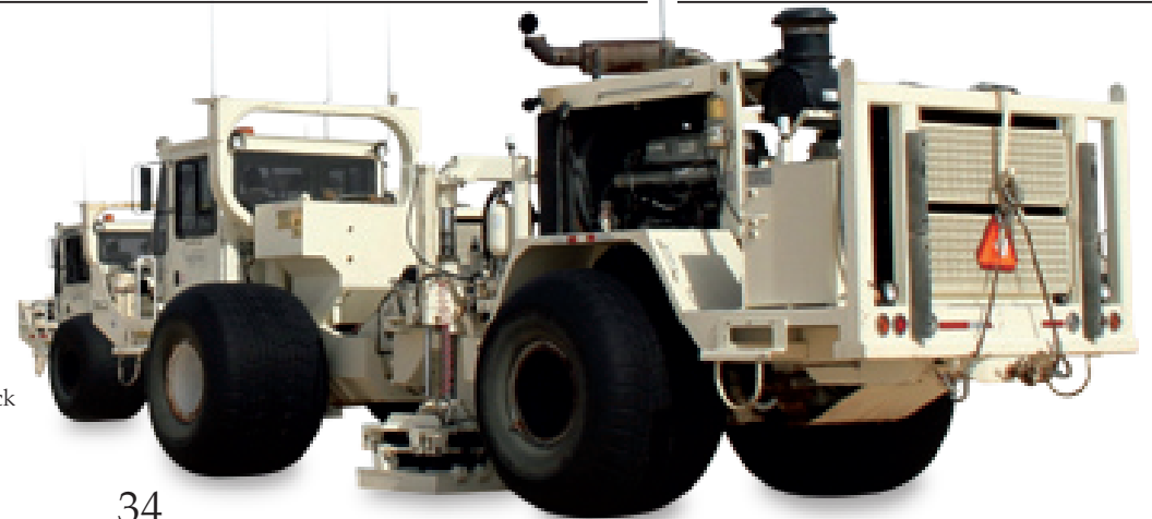
Seismic survey truck